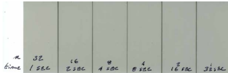
Figure 2: Intermittency test results: 1-32 second to 32-1 second exposures

Exposures were timed with a Darkroom Automation f-Stop timer. There was a nominal 2 second pause between exposures to simulate the time it takes to move a covering card when making sequential progressive test strips.